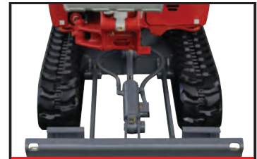
Retractable Track Frame

The TB225 features all steel construction, a spacious operator station, smooth hydraulic pilot joystick controls that deliver precise responsive controls. The TB225 provides the operator with the best in class engine output that allows more power and increases productivity.