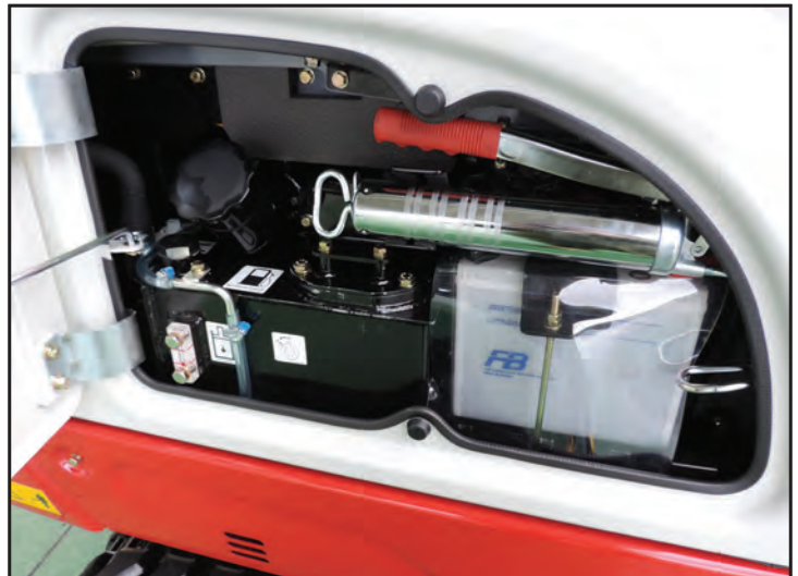
Convenient Service and Maintenance Access

*Functions may not be available in all countries, so please consult your Takeuchi dealer for details.