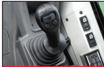
Pilot Operated Controls