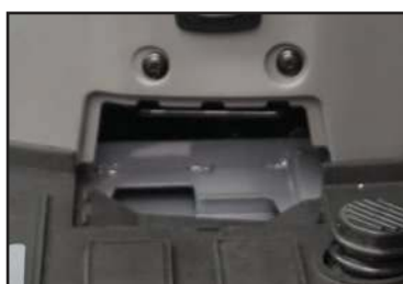
Drain on the Floor