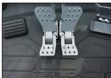
Foldable Travel Pedal (optional)