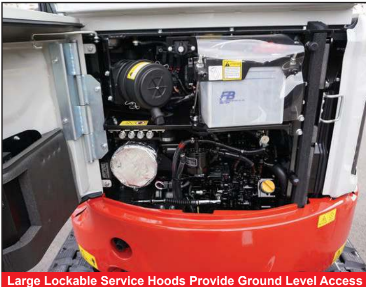
Large Lockable Service Hoods Provide Ground Level Access