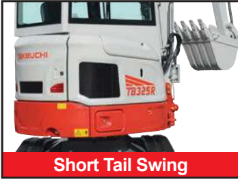
Short Tail Swing