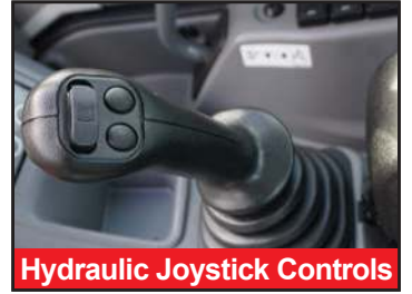
Hydraulic Joystick Controls

The TB325R is the newest addition to Takeuchi's 300-Series excavator lineup. This new model features a short tail-swing design which decreases the amount of overhang from the counterweight resulting in improved maneuverability and increased productivity on confined job sites. Due to its compact size and light weight, the TB325R can be easily transported.