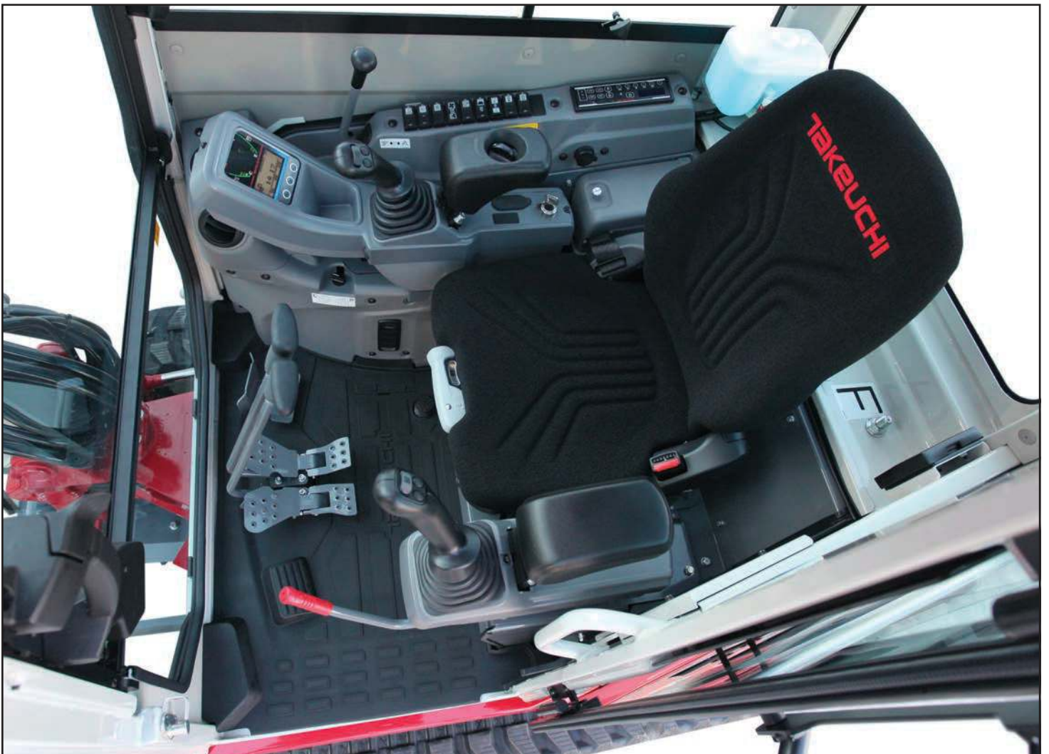
Spacious Operator's Station with Easy to Reach Controls and Switches

Standard features on the TB325R include an automatic fuel bleeding system which eliminates the need to manually prime the fuel system, automatic engine deceleration which helps conserve fuel, drain on the floor provides easier clean out and a heavy-duty wraparound counterweight which helps protect vital machine components. Additional features available on the TB325R include an LED work light package, multiple auxiliary hydraulic circuits, and an optional Takeuchi Fleet Management (TFM) telematics system.