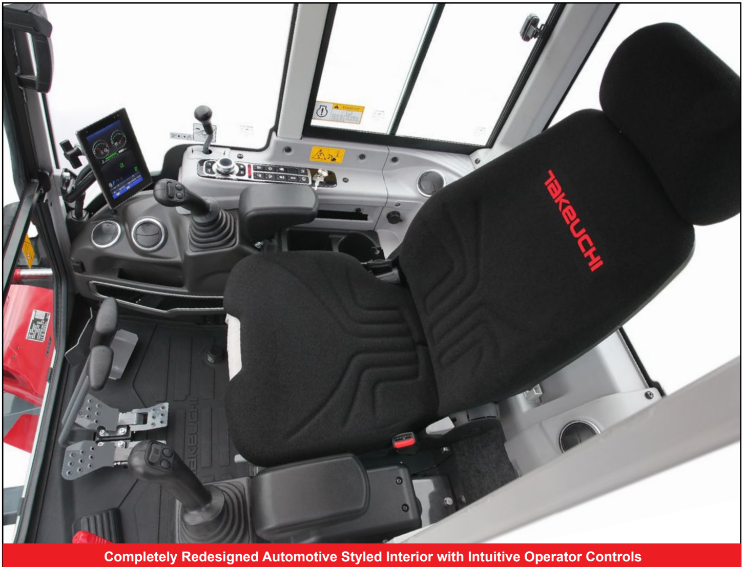
Completely Redesigned Automotive Styled Interior with Intuitive Operator Controls

Takeuchi's TB350R, TB300 Series, compact excavator features the latest technology and a short tail swing design that makes it ideal for working in tight or confined spaces. Inside the cab, a seven-inch, multifunction color monitor with touch screen places a wide range of functions at the operator's fingertips. A dedicated coupler circuit allows for the quick and easy exchange of various hydraulically driven attachments when used with an optional hydraulic coupler. A jog dial with one-touch controls lets operators easily control throttle position and multiple machine functions. The TB350R also offers a dig depth of 3,575 mm, maximum reach of 6,065 mm and maximum dump height of 3,945 mm. Combine those working ranges with its high-flow primary auxiliary circuit, and the TB350R is ideal for multiple applications, including demolition, land/vegetation management, general contracting, landscaping, hardscaping, rental, residential, and commercial construction.