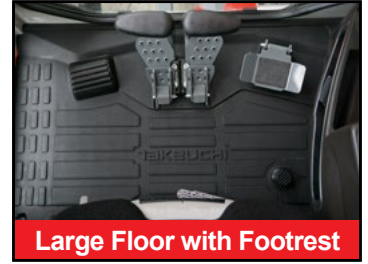
Large Floor with Footrest

Takeuchi's TB350R, TB300 Series, compact excavator features the latest technology and a short tail swing design that makes it ideal for working in tight or confined spaces. Inside the cab, a seven-inch, multifunction color monitor with touch screen places a wide range of functions at the operator's fingertips. A dedicated coupler circuit allows for the quick and easy exchange of various hydraulically driven attachments when used with an optional hydraulic coupler. A jog dial with one-touch controls lets operators easily control throttle position and multiple machine functions. The TB350R also offers a dig depth of 3,575 mm, maximum reach of 6,065 mm and maximum dump height of 3,945 mm. Combine those working ranges with its high-flow primary auxiliary circuit, and the TB350R is ideal for multiple applications, including demolition, land/vegetation management, general contracting, landscaping, hardscaping, rental, residential, and commercial construction.