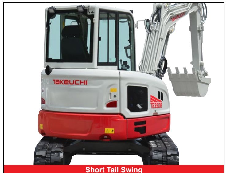
Short Tail Swing

*Functions may not be available in all countries, so please consult your Takeuchi dealer for details.