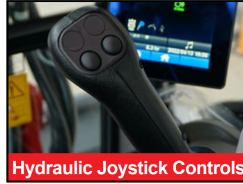
Hydraulic Joystick Controls