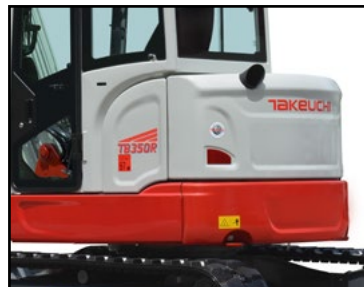
All Steel Construction