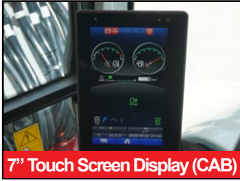
7" Touch Screen Display (CAB)