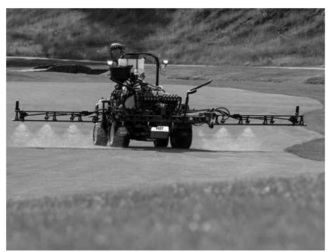
GeoLink's individual nozzle control saves time and money.

RTK: Real Time Kinematic (RTK) satellite correction is a technique used to enhance the precision of position data derived from satellite-based positioning systems, being usable in conjunction with all positioning platforms.