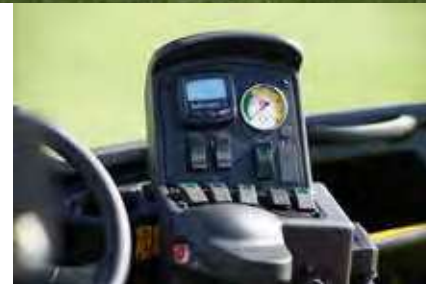
Quick Find Console®

The Toro Multi Pro WM is ready to perform when you need it most. Invite your Toro Distributor to demonstrate how this sprayer can enhance your spraying program.